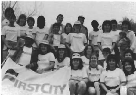
First City team

Every day more than 700 babies are born with birth defects. Some babies may have inherited abnormal genes; others may be the innocent victims of their prenatal environment — of pollution, chemicals, drugs, or malnutrition.