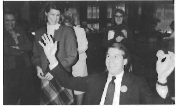
Monte, the big winner, is climbing to the top.