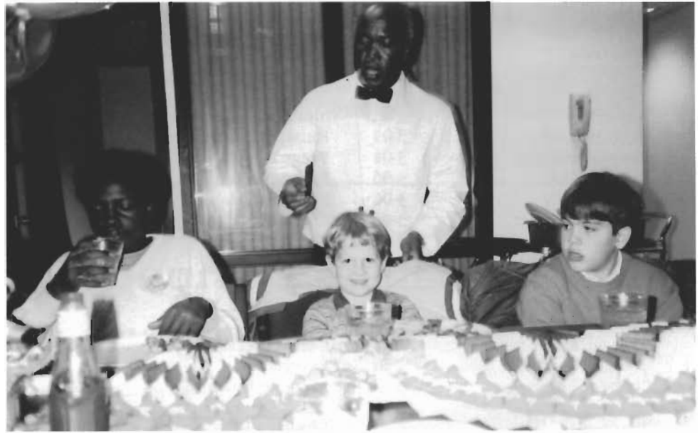
Some of the children enjoying lunch in the Officers' Dining Room.