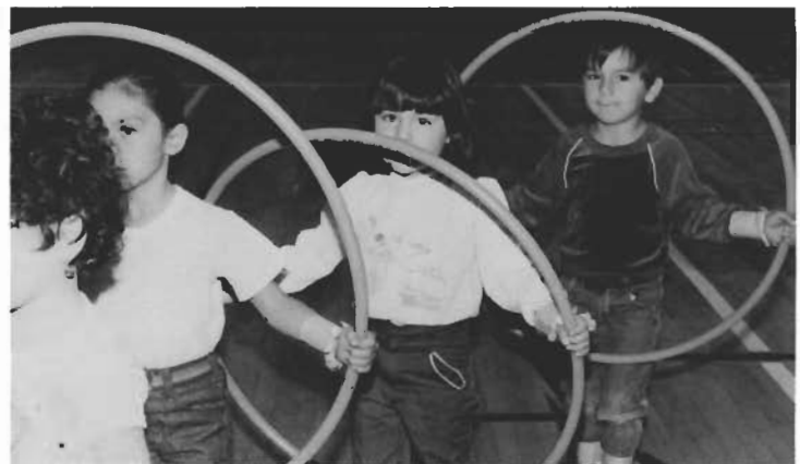
One kindergarten class presenting "The Circle" using movement and directional concepts.