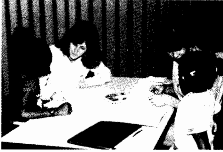
These volunteers are helping to make a difference.

What is a volunteer? A valuable resource that can increase a non-profit agency's ability to serve its clientele, enhance the existing services, and provide entirely new services. A volunteer is worth more than words can say and even more in dollars.