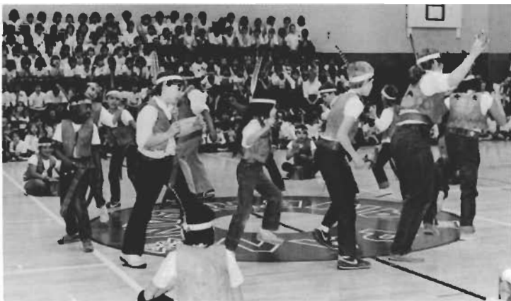
Here's a fourth grade class doing the "Indian Pow-Wow."

learned through the pure joy of movement to music with others.