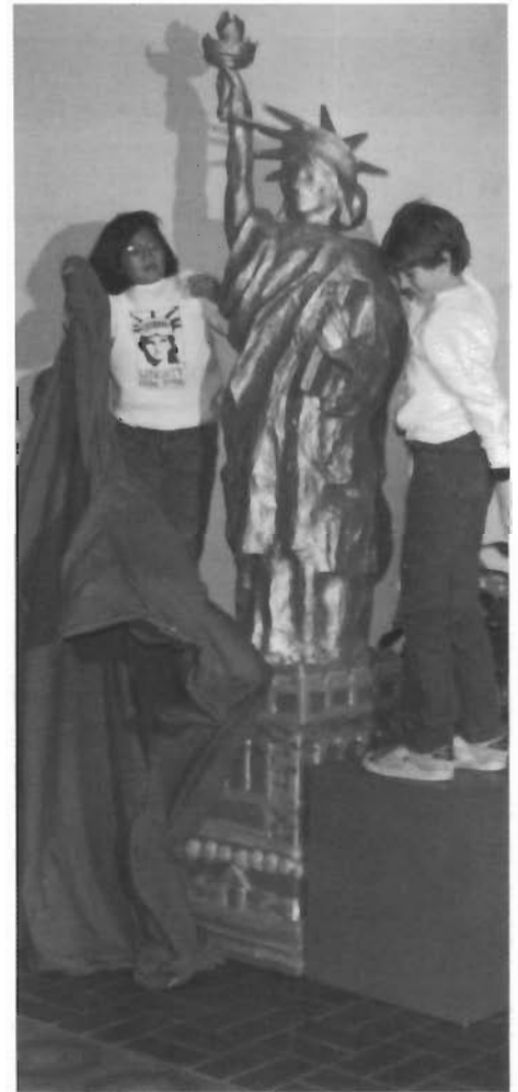
The unveiling of the Statue!

On January 8, the fifth grade class of Zavala Elementary hosted an unveiling of a project in our lobby that has been in the works for some time. Parents and friends were astounded to see an eight-foot replica of the Statue of Liberty in front of them. The likeness is truly remarkable, and if you have not had an opportunity to view the slide show and see the statue, it is on display in our lobby. Take a minute and drop by to see what our children have accomplished — it is truly a work of art.