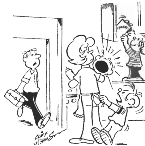
"Let me tell you about the lousy day I had at work!"